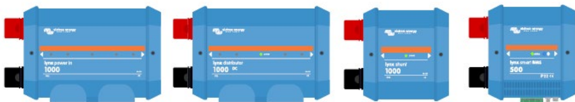
The Lynx modules: Lynx Power In, Lynx Distributor, Lynx Shunt VE.Can and Lynx Smart BMS